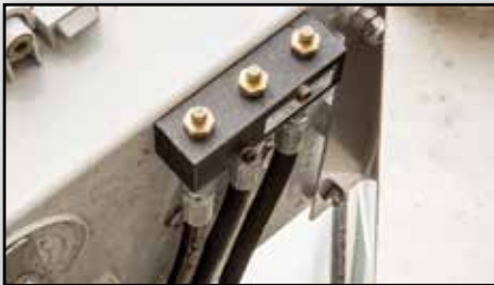
3020624 Remote Grease Kit