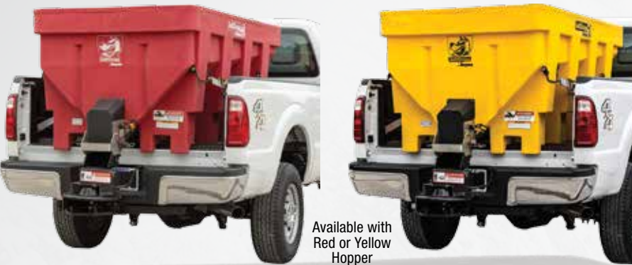
Available with Red or Yellow Hopper