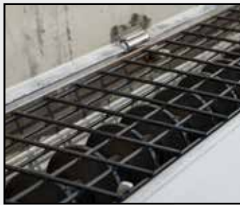
UTS auger screen