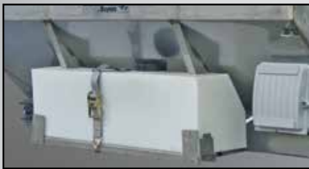
LS7 & LS8 (30 gal. poly reservoir)