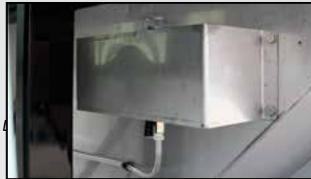
3020624 Stainless Steel Chain Lubricator Kit