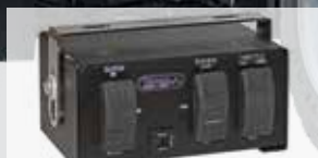
3010390 Controller for gas powered spreaders