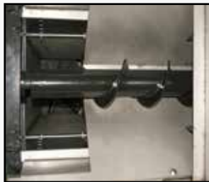
7" Hard Faced Auger

Additional sizes/configurations available. Call for quote.