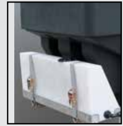
LS6 (30 gal. poly reservoir)