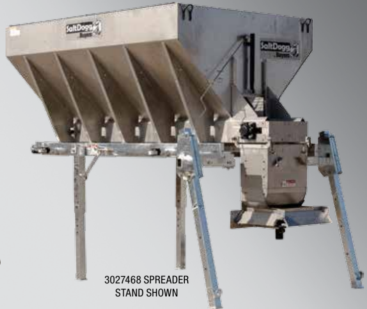
3027468 SPREADER STAND SHOWN