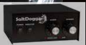
3016934 - Heavy Duty Variable Speed Controller