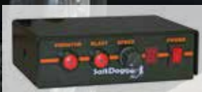
3011864 - Variable Speed Controller