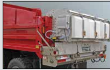
LS4T (tailgate mount 105 gal. poly reservoir)