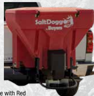
Available with Red or Yellow Hopper