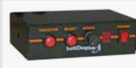
3011864 - Variable Speed Controller