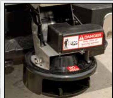
NEW high flow chute with larger 14" spinner, open trough, and shield that better protects truck from flying salt