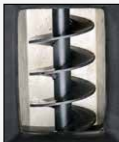
TGS07 Horizontal Auger with Stainless Steel Trough