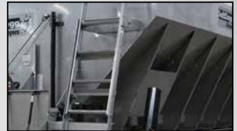
3022060 Stainless Steel Folding Spreader Ladder