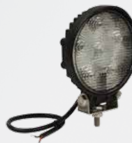
1492115 - 5" 12V-24V, Clear, 6 LED's, 1.5 Amps, 1350 Lumens