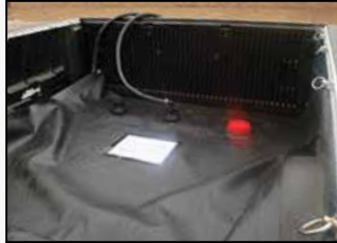
335 gal. poly bladder