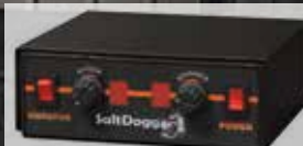
3014199 - Variable Speed Controller