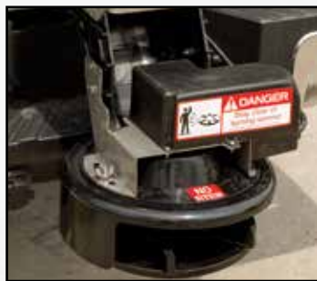
NEW high flow chute with larger 14" spinner, open trough, and shield that better protects truck from flying salt