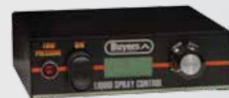
WSE1 - Electric Controller