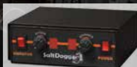
3014199 - Variable Speed Controller