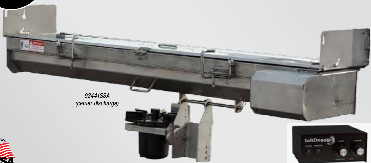
92441SSA (center discharge)