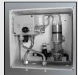
LS102H (Hydraulic Enclosure with Proportioning Valve)