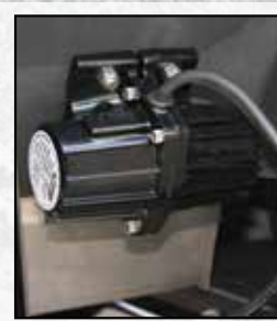
Prewired for Optional Vibrator Kit Shown Installed (3020340)