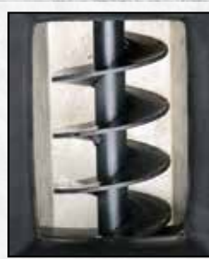
TGS03 Horizontal Auger with Stainless Steel Trough