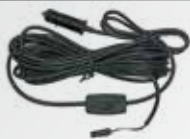
3001152 - Auxiliary Plug Adapter with on-off switch for TGSUV1B