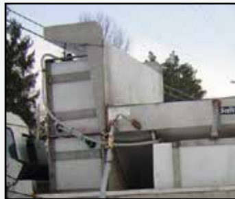
Optional Cab Guard (1497051)