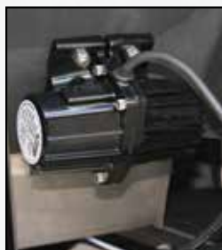
Standard Vibrator Kit Shown