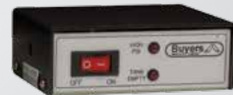
WSE75 - Hydraulic Controller