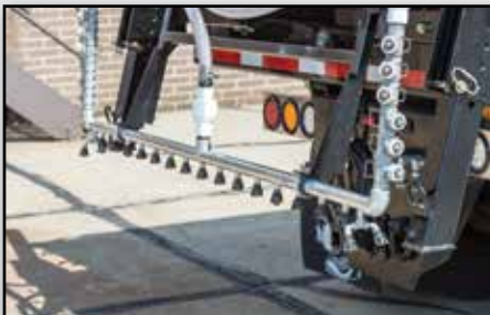
Anti-Ice Spray Bars