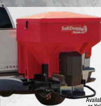
Available with Red or Yellow Hopper