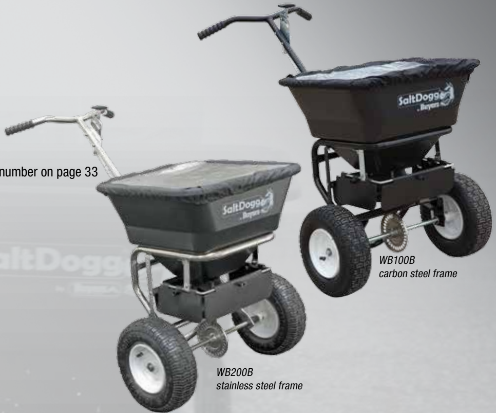
WB100B carbon steel frame