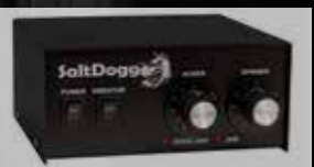
3016934 - Heavy Duty Variable Speed Controller