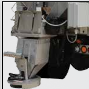
3026067 Lane Changing Chute