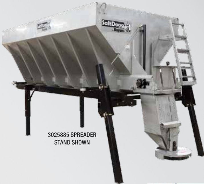
3025885 SPREADER STAND SHOWN