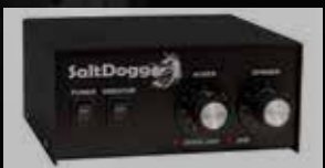
3016934 - Heavy Duty Variable Speed Controller