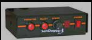
3011864 - Variable Speed Controller