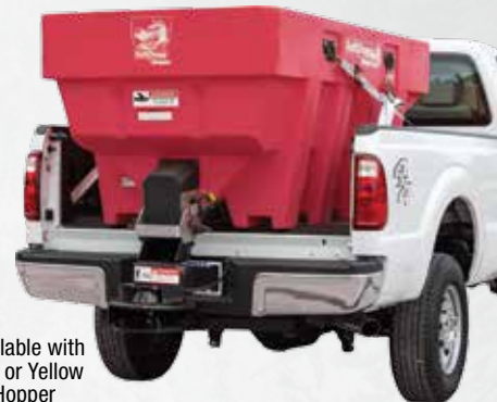
Available with Red or Yellow Hopper