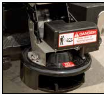
NEW high flow chute with larger 14" spinner, open trough, and shield that better protects truck from flying salt