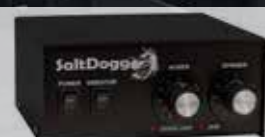
3016934 - Heavy Duty Variable Speed Controller