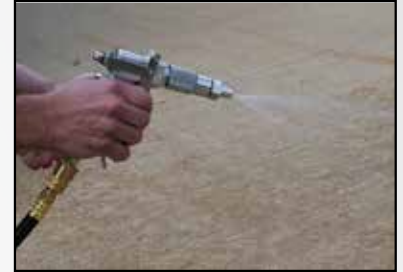
adjustable spray nozzle - pressure switch activates pump on demand