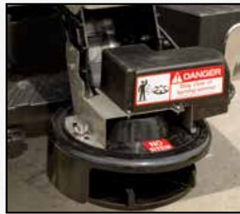
NEW high flow chute with larger 14" spinner, open trough, and shield that better protects truck from flying salt