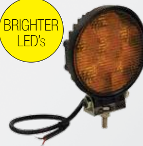
1492116 - 5" 12V-24V, Amber, 6 LED's, 1.5 Amps, 1350 Lumens