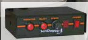
3011864 - Variable Speed Controller