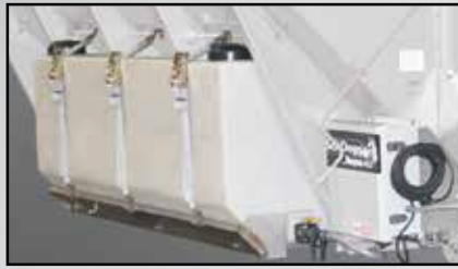
LS4 & LS5 (105 gal. poly reservoir)