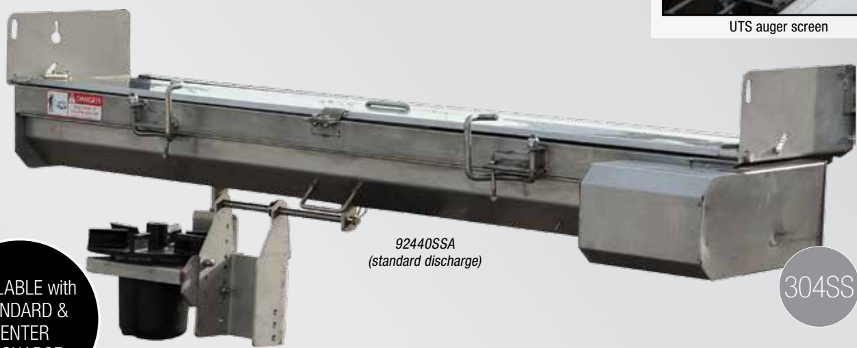
92440SSA (standard discharge)

AVAILABLE with STANDARD & CENTER DISCHARGE