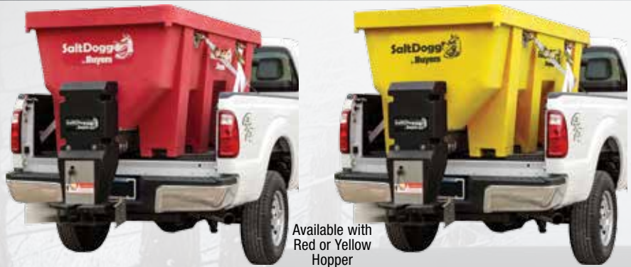
Available with Red or Yellow Hopper