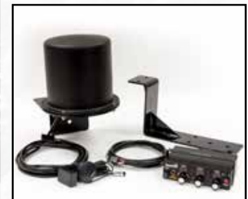
Optional Electric-Hydraulic Proportional Spreader Control Kit w/ Garmin® GPS Ground Speed Antenna (HV1030EPG)