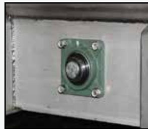
2" Auger Bearing