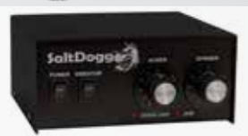
3016934 - Heavy Duty Variable Speed Controller