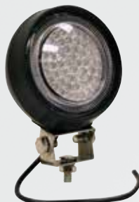
1492110 - 5" 12V-24V, Clear, 54 LED's, .3 Amps, 375 Lumens