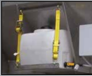
LS1 & LS3 (55 gal. poly reservoir)