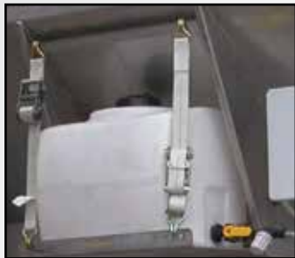
Optional LS1 Liquid Spray System (fits 3 - 4.5 cu. yds.)