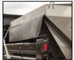
Optional Rubber Side Deflectors Part No. 1492144