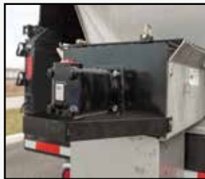
High Torque Auger Motor