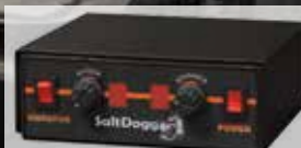
3014199 - Variable Speed Controller