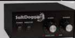
3016934 - Heavy Duty Variable Speed Controller