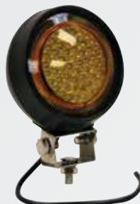
1492111 - 5" 12V-24V, Amber, 54 LED's, .3 Amps, 375 Lumens