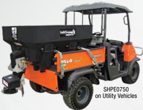
SHPE0750 on Utility Vehicles