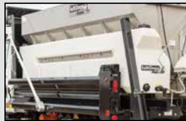
LS10 (two, 400 gal. poly reservoirs)