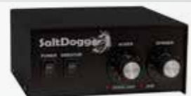
3016934 - Heavy Duty Variable Speed Controller