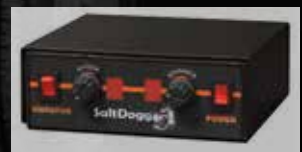
3014199 - Variable Speed Controller