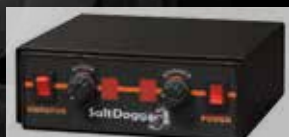
3014199 - Variable Speed Controller