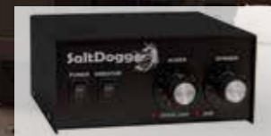
3016934 Controller for electric powdered spreaders