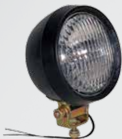
1492100 - 5" 12V-24V Clear, 2.92 Amps, 35 Watts

See more at www.buyersproducts.com/Electrical-Lighting